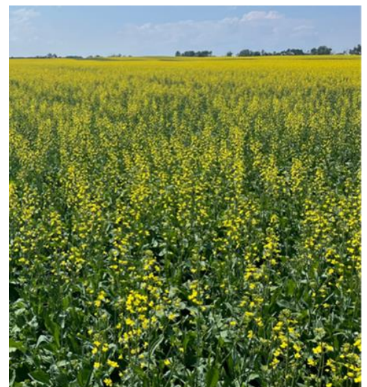
July 6, 2023 Langenburg, SK