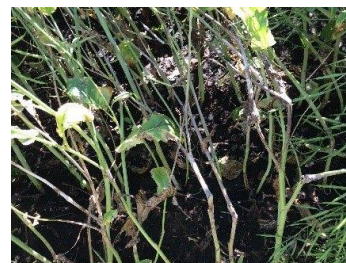
Figure 2. Symptoms of sclerotinia stem rot within canola crop canopy.