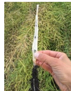
Figure 5. Sclerotia bodies in infected canola stem.