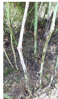
Figure 3. Canola stems infected with sclerotinia stem rot.