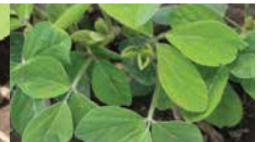
Standard IST + FST